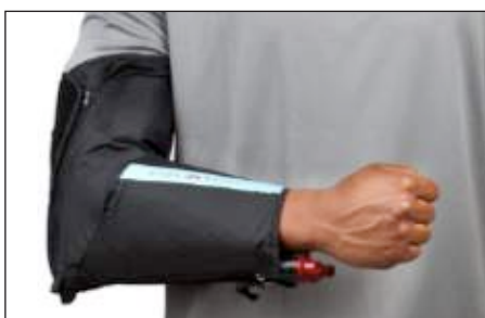
Flexed Elbow Wrap