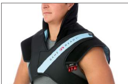
C-T Spine Wrap