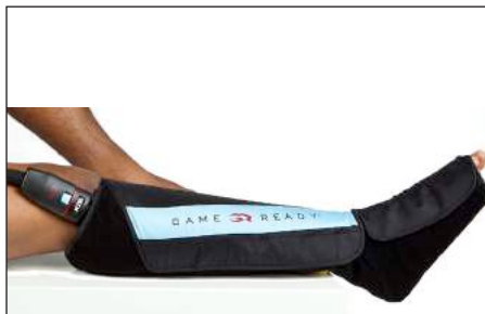
Half Boot Wrap