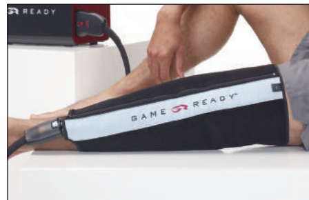
Straight Knee Wrap