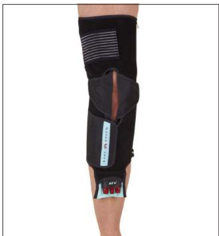
Articulated Knee Wrap